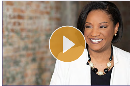
WHY YOU NEED A HEADSHOT