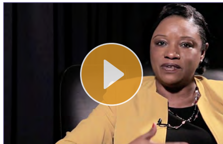
SARDERTV AUTHOR TALKS