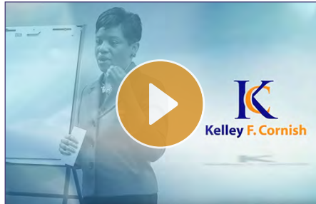
MANAGING YOUR TIME WITH EXCELLENCE